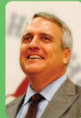
Bill Ritter Jr. Bill Ritter GOVERNOR OF COLORADO

To learn how your State can join the movement, or for tips on how you can become an EcoDriver™ on your own, log onto ecodrivingusa.com .