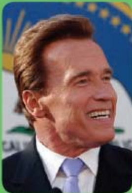
Arnold Schwarzenegger Arnold Schwarzenegger GOVERNOR OF CALIFORNIA

AS GOVERNORS FROM TWO DIFFERENT POLITICAL PARTIES, we may not see eye to eye on every issue. But one issue we can put our bipartisan differences aside and agree on is our nation's rising gas prices. Something needs to be done. Which is why we have come together, representing California and Colorado, to encourage Governors of all States to become Green States, and join us in the EcoDriving™ program.